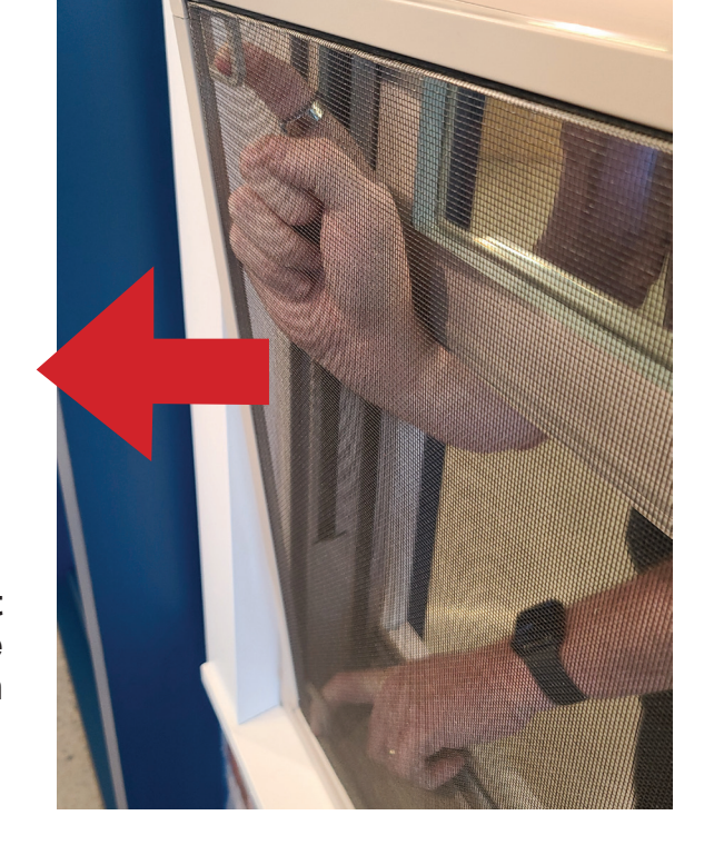
Then, push out to remove the screen

Pull over to the opposite side of the screen