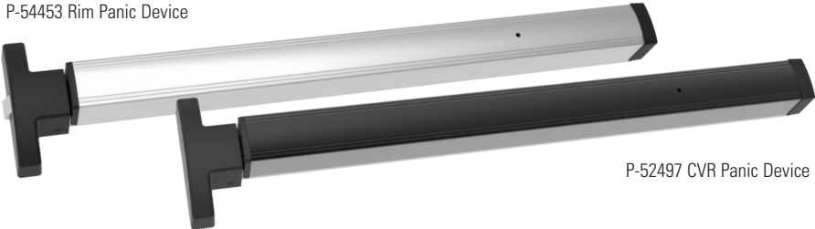
P-52497 CVR Panic Device

You can view all of our standard entrance hardware options by selecting the entrance hardware data sheets on our product guide at www.ykkap.com