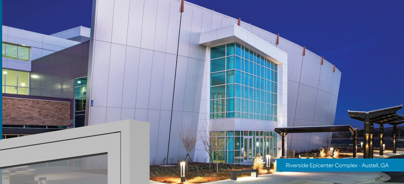
Riverside Epicenter Complex - Austell, GA