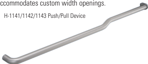
H-1141/1142/1143 Push/Pull Device

The one inch diameter push/pull provides flexibility and occupant safety. The pull handle is open to permit access to the lock cylinder, but is slightly angled to provide a uniquely modern look. The push bar starts at the locking stile, but then has an ergonomic "S-Bend" toward the locking stile to bring the bar closer to the door where it is captured by an end cap. This innovative push bar also accommodates custom width openings.