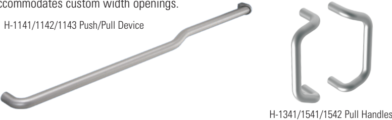
H-1141/1142/1143 Push/Pull Device

Exit/Panic Devices The modern and economical standard touch bar exit devices are ideally suited for all applications that require emergency egress. The devices are ANSI Grade 1, carry the UL label and are approved for Life Safety. Both the rim and concealed devices feature single point dogging and are available with electric actuation.