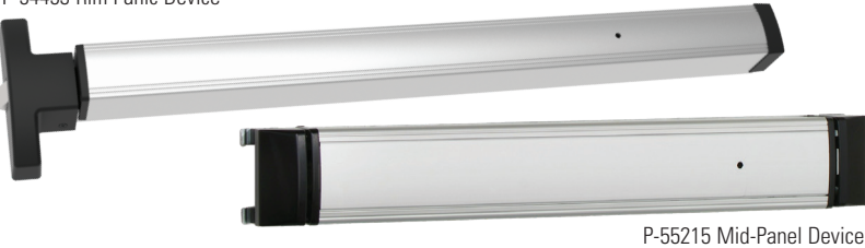
P-54453 Rim Panic Device

You can view all of our standard entrance hardware options by selecting the entrance hardware data sheets on our product guide at www.ykkap.com