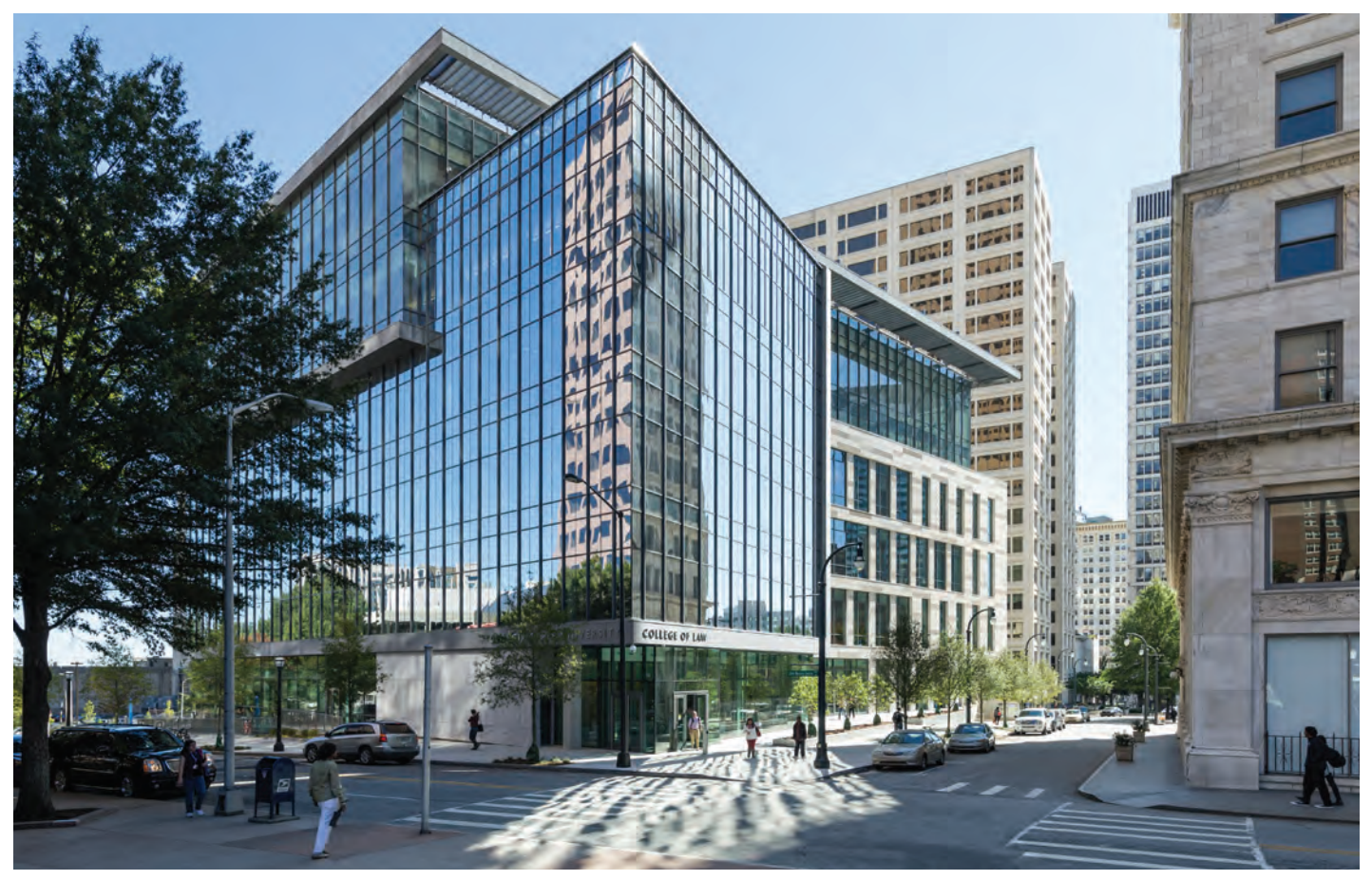
Georgira State University Law Building

YKK AP can provide more post or pre-consumer aluminum recycled content on certain projects. The project must be reviewed prior to quotation to make sure we can meet the desired criteria and meet the project's schedule.