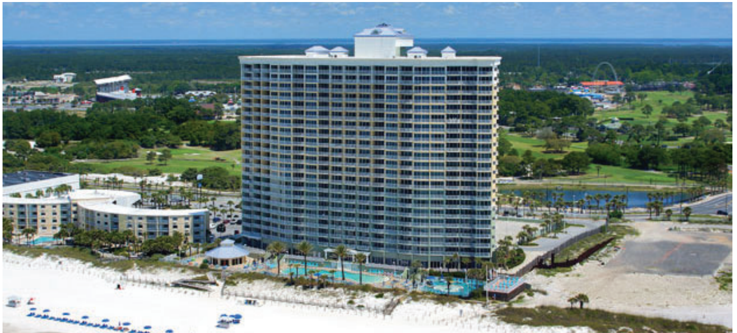
Boardwalk Beach Resort - Panama City Beach, FL

Additional information including CAD details, CSI specifications, Test Reports and Installation instructions are available online at: