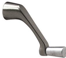
Roto Operator Crank Handle