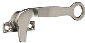
Pole Cam Handle (Optional)