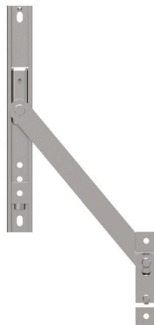
Keyed Limit Device