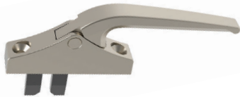
Multi Point Handle