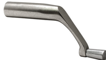
Roto Operator Crank Handle - Casement