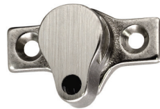
Custodial Cam Handle (Optional)