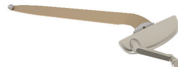
Roto Operator - Casement