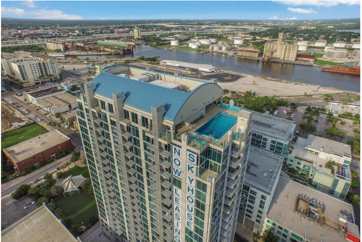
Skyhouse Channelside Apartments - Tampa, FL

Additional information including CAD details, CSI specifications, Test Reports and Installation instructions are available online at: www.ykkap.com/commercial/product/curtain-walls/yhc-300-ig/