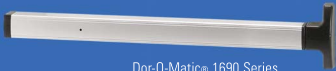
Dor-O-Matic® 1690 Series Concealed Vertical Rod Exit Device