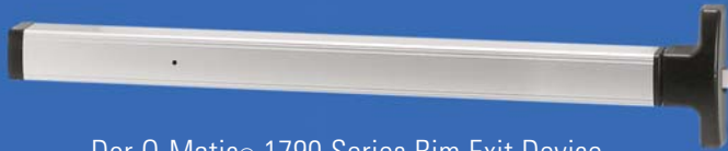
Dor-O-Matic® 1790 Series Rim Exit Device