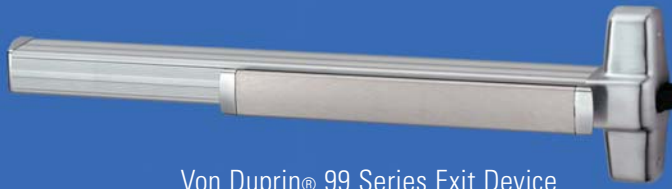
Von Duprin® 99 Series Exit Device