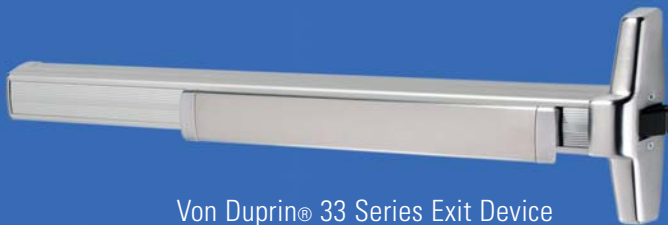
Von Duprin® 33 Series Exit Device