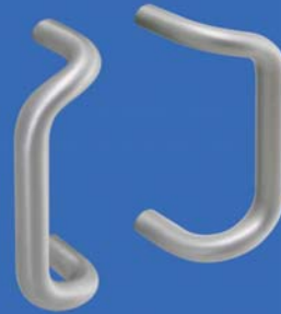
YKK AP Smart Series Pulls

The new and modern Touch Bar exit device from Dor-O-Matic® is ideally suited for all applications that require emergency egress. The device is ANSI Grade 1, carries the UL label and is approved for Life Safety. The concealed vertical rod features single point dogging and is available with electric actuation.