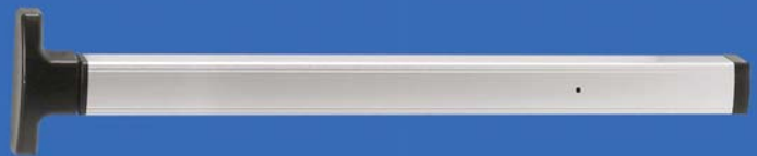
Dor-O-Matic® 1490 Series Concealed Vertical Rod Exit Device