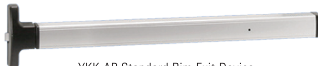
YKK AP Standard Rim Exit Device