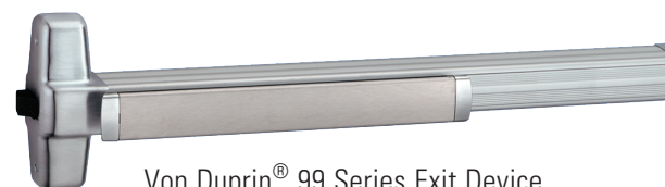
Von Duprin® 99 Series Exit Device