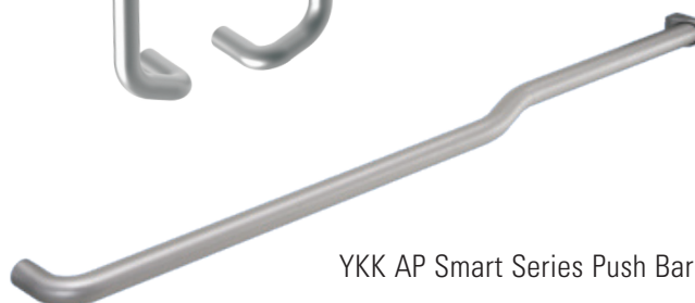
YKK AP Smart Series Push Bar