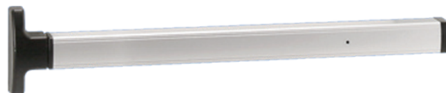
YKK AP Standard Concealed Vertical Rod Exit Device

The modern and economical YKK AP standard touch bar exit devices are ideally suited for all applications that require emergency egress. The devices are ANSI Grade 1, carry the UL label and are approved for Life Safety. Both the rim and concealed vertical rod devices feature single point dogging and are available with electric actuation.