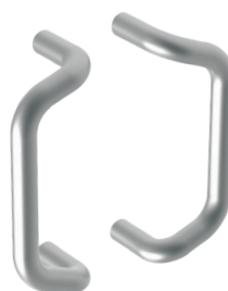
YKK AP Smart Series Pulls

YKK AP's Smart Series one inch diameter Push/Pull provides maximum flexibility and occupant safety. The pull handle is open to permit access to the lock cylinder and is slightly angled to provide a uniquely modern look. The Smart Push starts at the locking stile similar to a typical one inch diameter push bar, but then has an ergonomic "S-Bend" toward the locking stile to bring the bar closer to the door where it is captured by a patented end cap. This innovative push bar easily accommodates custom width openings while subtly informing a pedestrian which side of the door to push on when exiting a building.