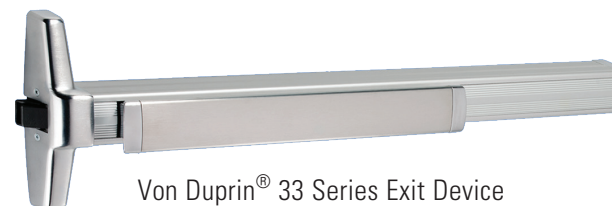
Von Duprin® 33 Series Exit Device

These top quality exit devices from Von Duprin® are also perfectly suited for all applications that require emergency egress. They are also ANSI Grade 1, carry the UL label and are approved for Life Safety. Both the rim and concealed vertical rod devices feature single point dogging and are available with electric actuation.